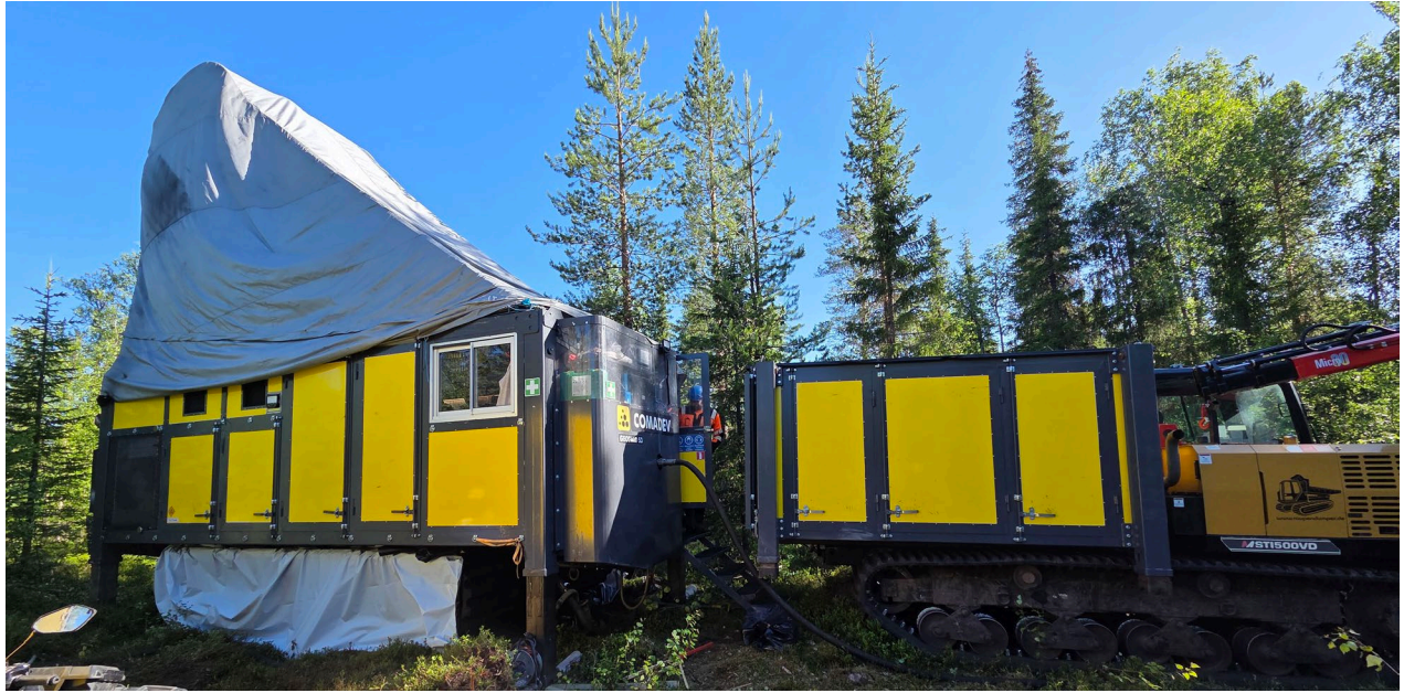
Figure 3. Diamond drill rig on location at the first Killero W target.

Eric Roth, Capella’s President and CEO, commented: “I am very pleased to be announcing today the commencement of a maiden diamond drill program at the Killero W project. The initial focus will be on two gold-copper targets which are defined by coincident Base of Till anomalies, favourable host rocks, and highly prospective cross cutting structural corridors. Further potential also exists for the definition of additional target areas outside of these core areas. I look forward to keeping the market updated as we advance with drill testing at Killero W”.