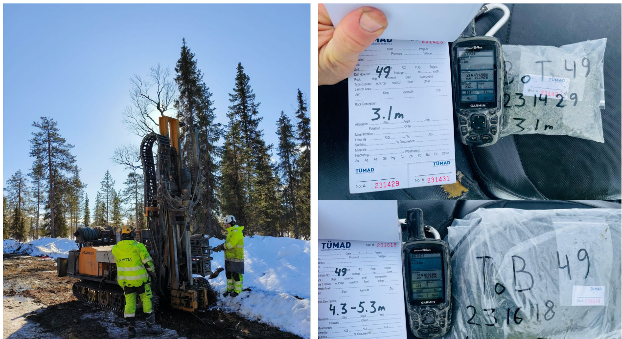
Figure 2. Base of Till / Top of Bedrock sampling rig and samples.