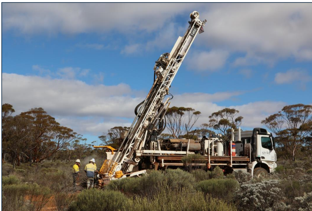
Figure 1: Strike Drilling AC/RC drill rig on site at Killaloe.

Lachlan Star Limited (ASX: LSA, Lachlan Star or the Company) is pleased to advise that its maiden drilling program has commenced at the Killaloe Gold Project, located within the Norseman region of the Eastern Goldfields of Western Australia.