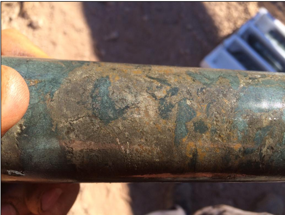
Figure 3: Semi Massive pyrrhotite pentlandite (XRF to 1.75% Ni), KLDH01 137.5 - 137.7m