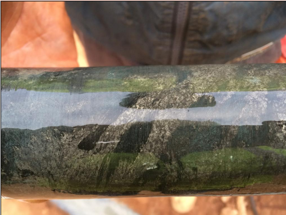
Figure 2: Semi Massive pyrrhotite pentlandite (XRF to 3.15% Ni), KLDH01 93.15 - 93.35m